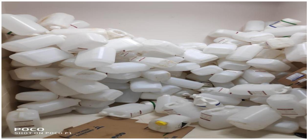
Unused plastic canes of Bicarbonate (10 liter) for the process of discarding at Dialysis Unit.