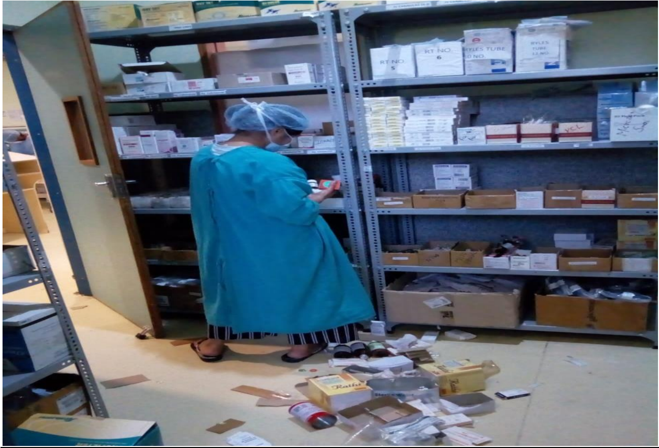
Rearranging Store cupboard at ICU