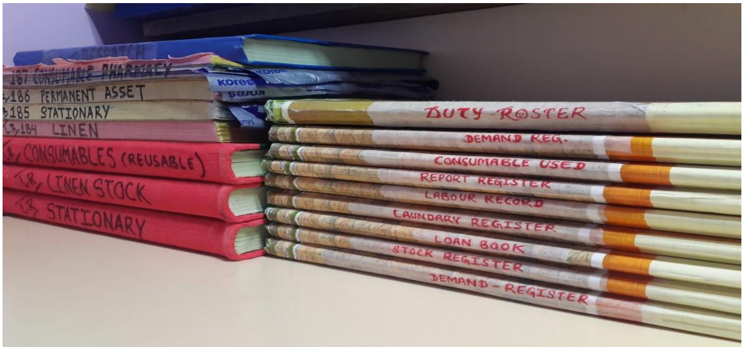
Records arranged systematically & beautifully in Pediatric Ward